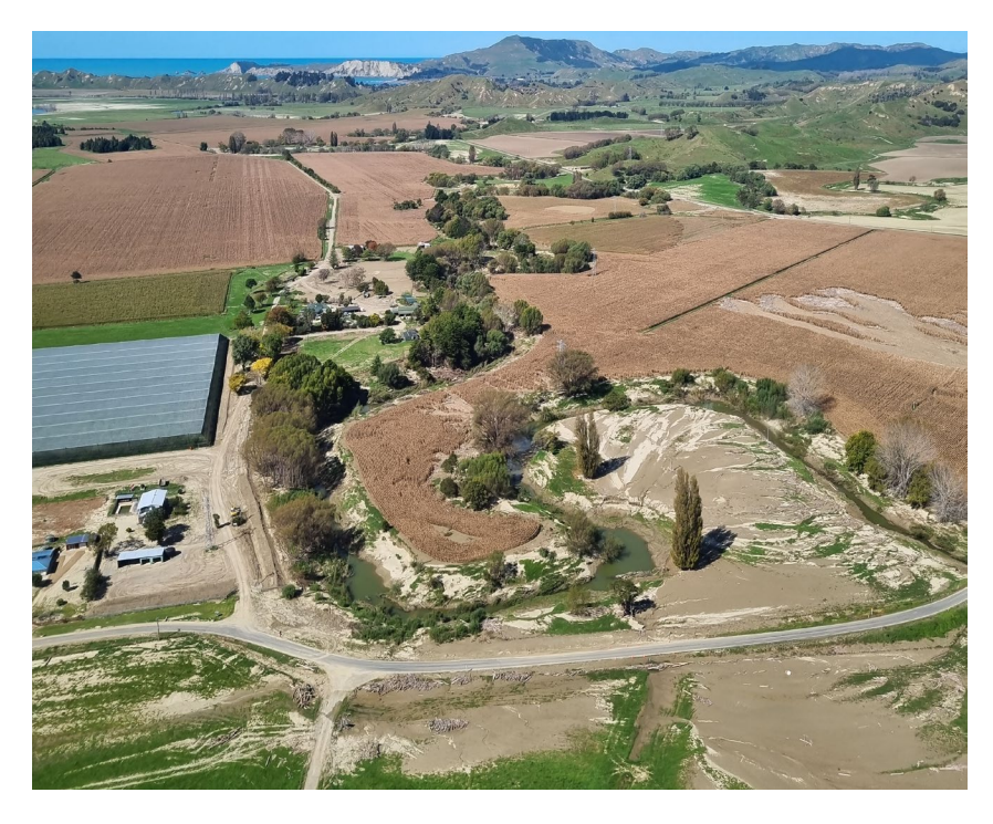
Figure 2: Flooding of unprotected productive land, causing damage to crops in Tairawhiti

7. We note that the two councils in the Inquiry area are likely to need financial and technical support to undertake a flood-capacity assessment identifying blockages, and to resolve those individual issues. However, we recognise that the inability of smaller councils to fund catchmentmanagement activities is a symptom of the broader challenges around funding local government services, as discussed in the Leadership and governance section.