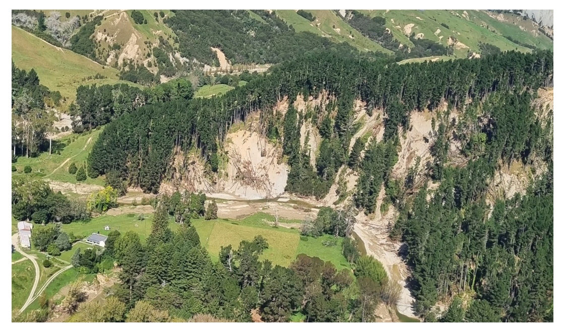
Figure 7: Trees on a steep 'purple zone' face that needs to be transitioned from plantation forest