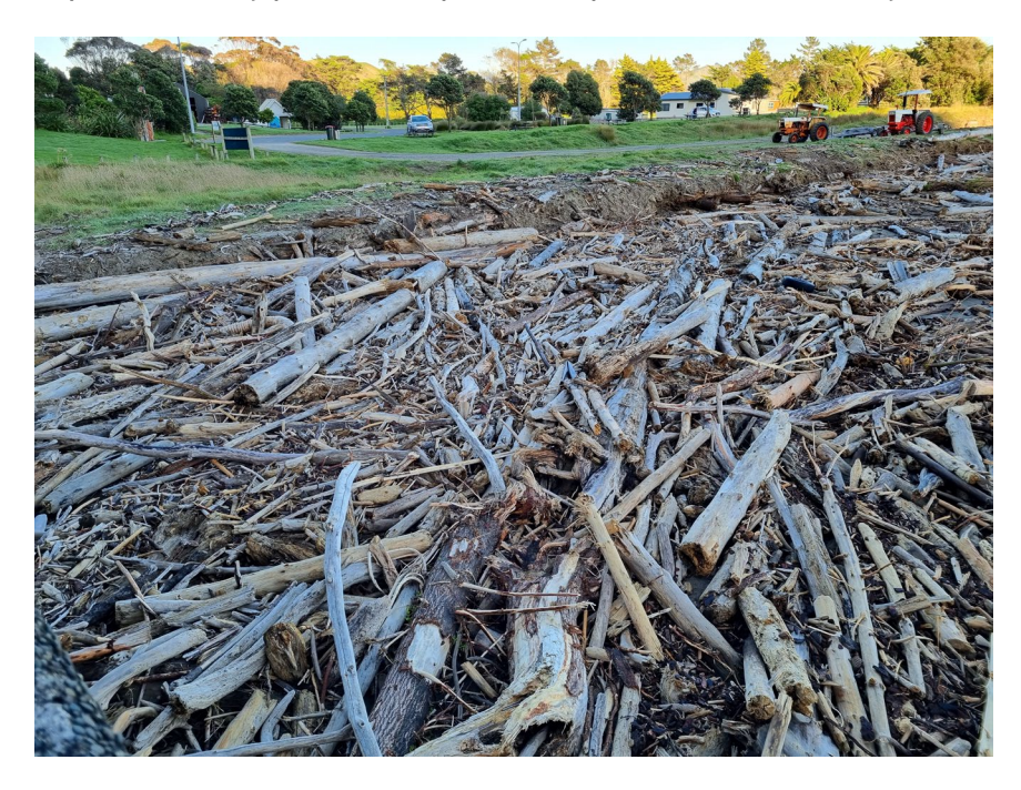
Figure 1: The debris from Cyclone Gabrielle on the Tolaga Bay beach. Some of the children present at the Tolaga Bay hui have never seen the beach clear of debris. It is a mix of forestry slash, whole trees, willow and rubbish

that debris traps have broad application. We have concluded that the only credible way of reducing the mobilisation risk from debris already in the system is to remove it (and ultimately to improve forestry practices to prevent deposits of debris in risky locations).