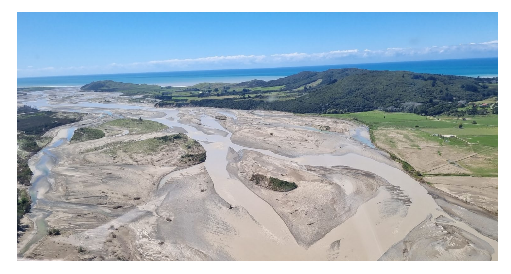
Figure 3: Aggradation in the lower reaches of the Waiapu River, causing the river to breach its channel, and deposit sediment on adjacent land

7. We note that the two councils in the Inquiry area are likely to need financial and technical support to undertake a flood-capacity assessment identifying blockages, and to resolve those individual issues. However, we recognise that the inability of smaller councils to fund catchmentmanagement activities is a symptom of the broader challenges around funding local government services, as discussed in the Leadership and governance section.