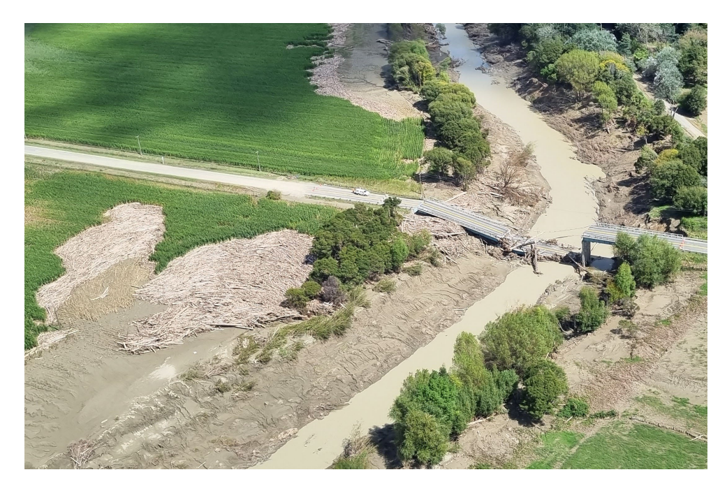
Figure 4: Broken State Highway 35 at Hikuwai