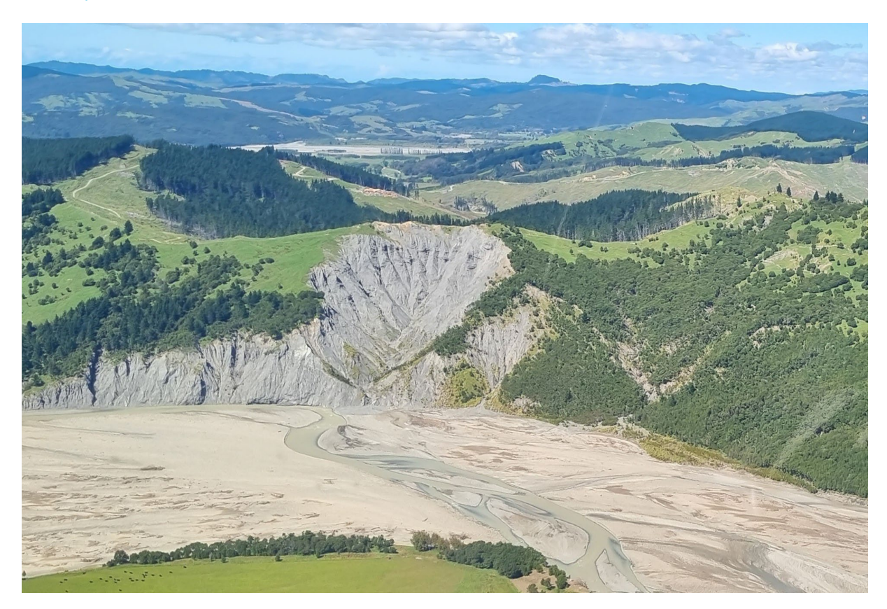
Figure 6: Untreated gully erosion, Tairawhiti. "Gully Erosion is a cancer in the Waiapu Catchment" (Mike Marden)

reducing soil loss in the process. Proposed changes to forestry management are discussed in the Forestry section.