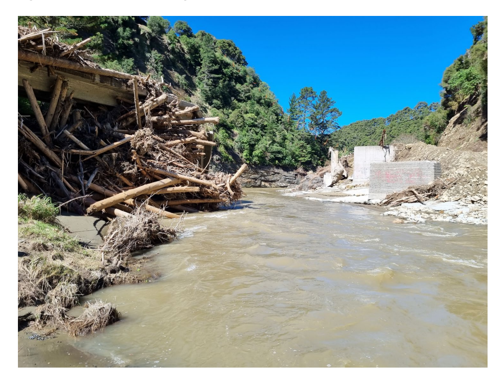
Figure 5: Broken State Highway 2 at Waikare

14. There is no redundancy in the roading system – no alternative to when SH35 fails as it so often does. Te Ara Tipuna, a proposed 657km network of continuous tracks and trails from Gisborne to Opotiki can help offset the complete reliance on SH35. While providing for land-use outcomes for over 350 land blocks along its journey, Te Ara Tipuna will be an alternative access and exit route for East Coast communities during times of emergency. We heard that Te Ara Tipuna can provide for a specific strengthened civil defence standard accessway between Tokomaru Bay and